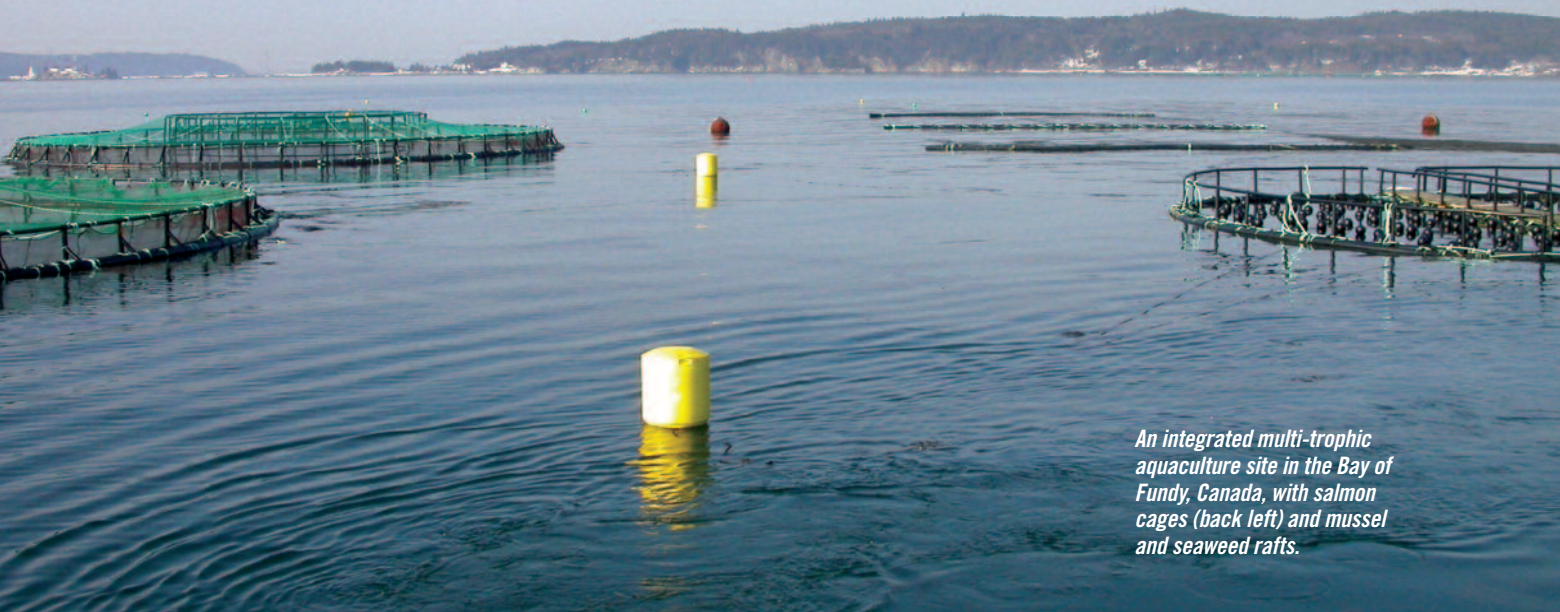
An integrated multi-trophic aquaculture site in the Bay of Fundy, Canada, with salmon cages (back left) and mussel and seaweed rafts.