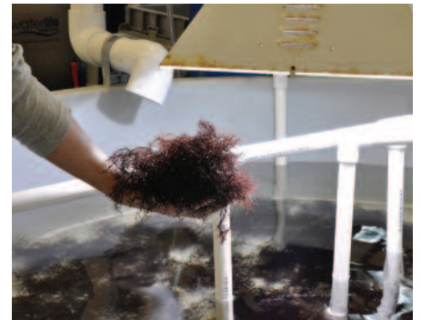
Tank-grown Gracilaria .

IMTA can be done in marine or fresh water, temperate or tropical regions, and in tanks. "It's a theme and has variations...like music," says Chopin. "IMTA is the theme, and the variations are the